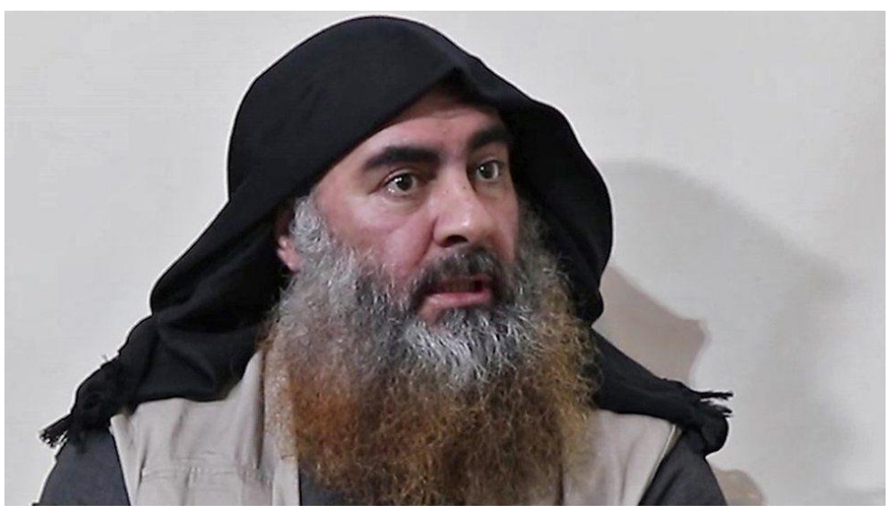
The late ISIS leader al-Baghdadi: Source: bbc.com