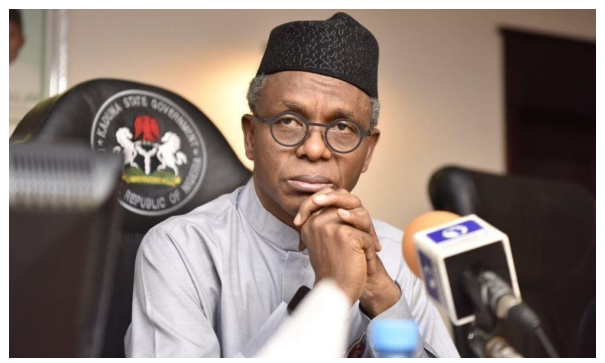
Governor Nasir el-Rufai: he attempted to promulgate a law to regulate religious preaching in Kaduna State.

To prevent mayhem by the next Abubakar Shekau, the federal government must assemble religious leaders, elite and traditional rulers to come to a consensus on 'what not to preach,' and make a binding legislation around it. As long as children, youths, young adults, and even the elderly continued to feed on contaminated, distorted, revolutionary and hate-filled sermons bordering on martyrdom from self-appointed fiery Jihadist preachers, Nigeria will not escape the curse of Jihadist attacks and destruction.