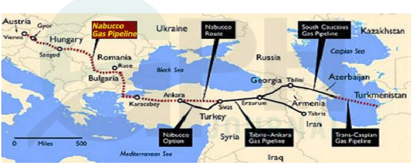
Figure (1) illustrates the route of the Nabucco pipeline, which aimed at liberating Europe from Russian domination