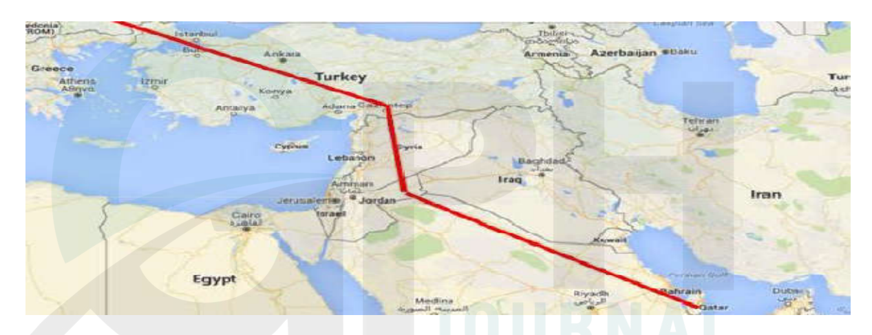
Figure (2) illustrates the route of the Qatar-Syria pipeline, which is adopted by the United States

A) The overthrow of the "Nabucco" project which would have prevented Moscow from passing the Russian gas to Europe through the Mediterranean Sea and excluding the project of transporting Qatari gas to Europe that pass through Syria and Turkey. In return to supporting the Syrian regime, Russia would passing a gas pipeline – named Al Islami gas-through Iran, Iraq and Syria to Europe.