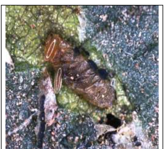
Fig. 4. Parasitization of leaf miner larvae by Diglyphus isaea