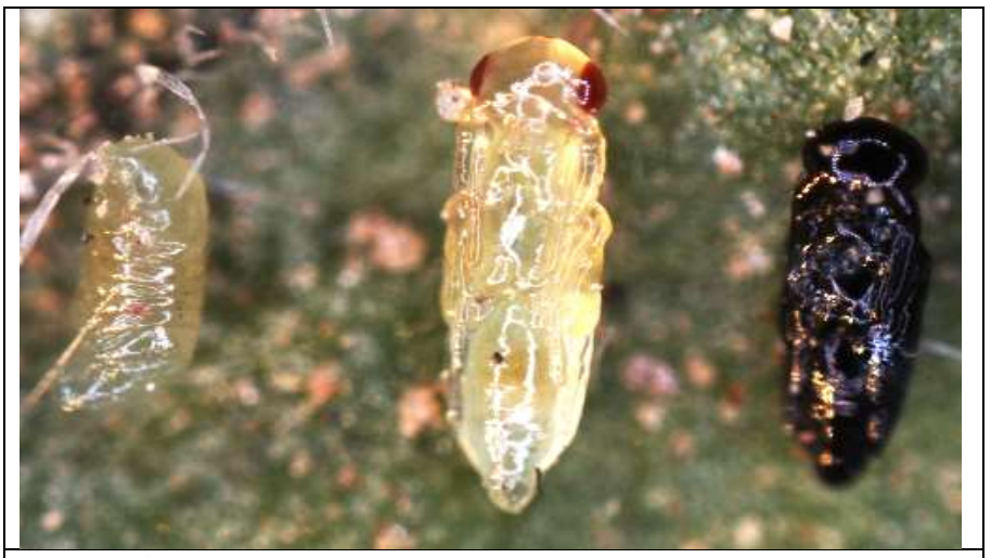
Fig. 5. Larval, Prepupal and Pupal Stages of D. isaea