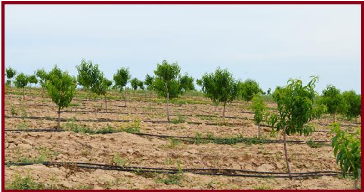
Fig.3. Demonstration of the micro-irrigation regime using drip irrigation of fruit trees in the conditions of the EIA of the Research Institute of Erosion and Irrigation in the Shamakhi district in the village of Malkham.

The discharge was 20-30%, which led to uneven moistening. At the beginning of vegetation due to timely treatments, the surface discharge decreased (up to 8-10%). When the treatment of crops ceased, the discharge again reached 16-17%.